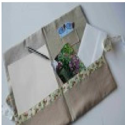
Padded Linen Folder